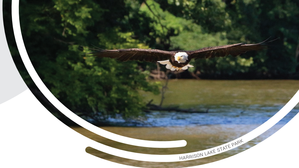
HARRISON LAKE STATE PARK