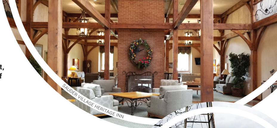
SAUDER VILLAGE HERITAGE INN