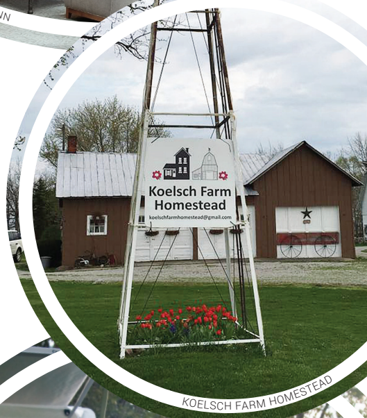
KOELSCH FARM HOMESTEAD